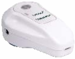
ReMeDi ® Electronic Stethoscope

Neurosynaptic offers ReMeDi Telehealth Solution that is perfectly suitable for the Point-of-Care services. The Low Energy Bluetooth enabled devices provide a powerful interface to work with Computers, Mobile Phones and Tablets with equal ease. Extreme power efficiency ensures usage for several days after charging, and the Patented "Safe Devices" interface provides unique controllability and usage tracking, avoiding Human Errors.