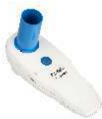
ReMeDi ® Spirometer

Neurosynaptic also provides a range of other integrated sensors from partners. These include several blood & urine chemistry tests, and scopes which enables up to 35 different point of care tests.